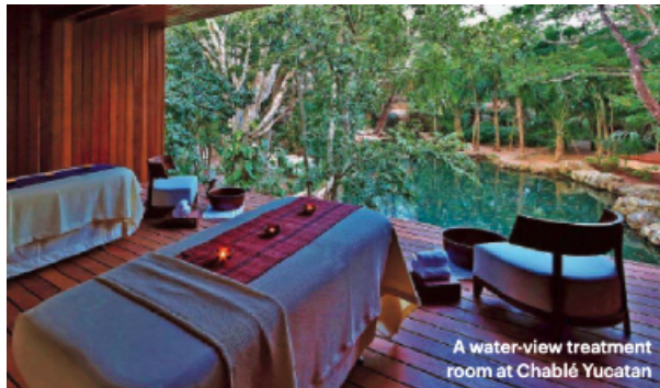
A water-view treatment room at Chablé Yucatan