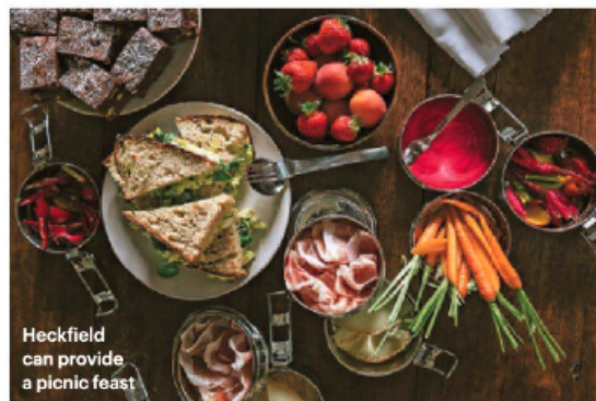
Heckfield can provide a picnic feast

BOOK IT Wildsmith Radical Botany Facial, £220, and reflexology, £160. Rooms from £350 a night, including breakfast and afternoon tea; heckfieldplace.com