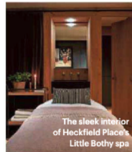
The sleek interior of Heckfield Place’s Little Bothy spa

WHAT TO TRY The Little Bothy spa is chic and discreet. Using its own products, made from local