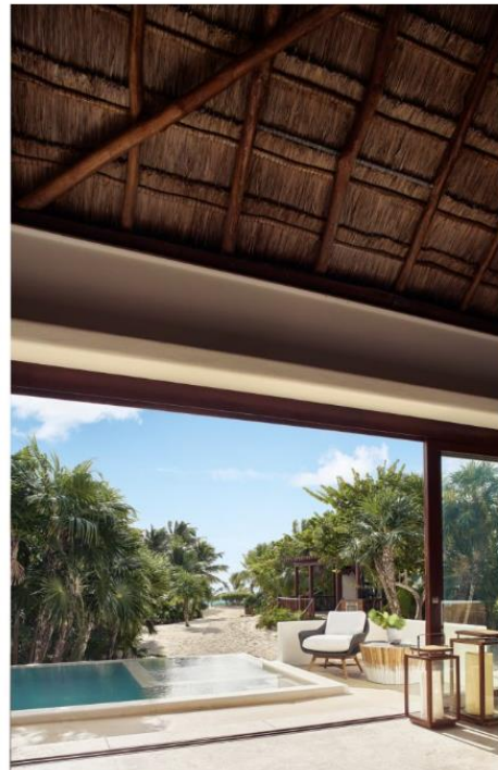
Casa Chablé, located in Mexico's Sian Ka'an Biosphere Reserve.