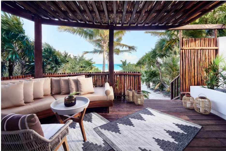
Casa Chablé.