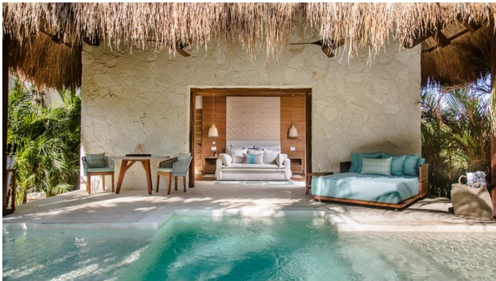
Chablé Maroma in Riviera Maya, Mexico.