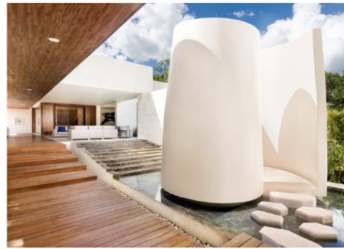
Chablé Yucatán.